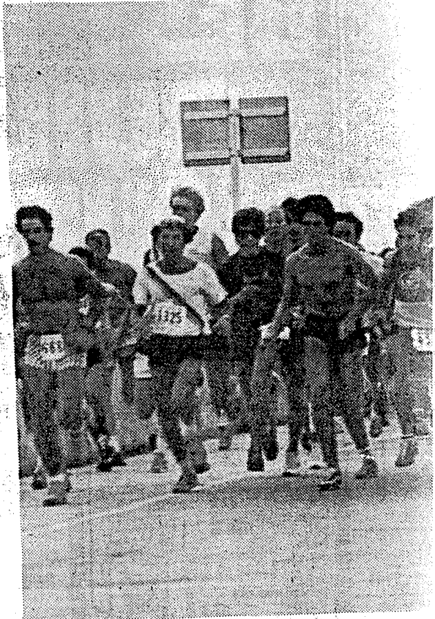
RUNNERS CHARGE forward for the start of the race at 7:30 a.m. with cool temperatures and a slight breeze.

Some local motels reportedly filled up before the race with the manager of the Holiday Inn at Marathon saying the normal 60 percent capacity for this time of year was at 95 percent or 97 percent because of the run.